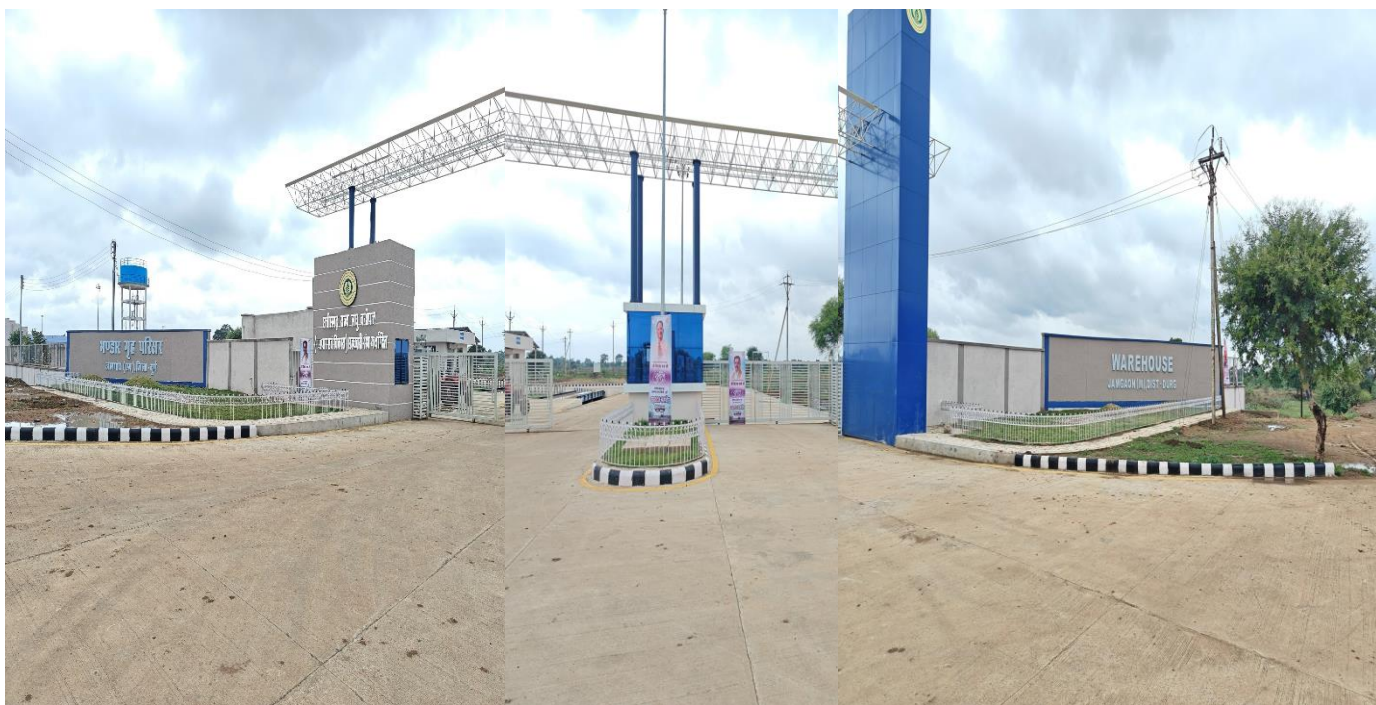
Main Entrance of the Warehouse