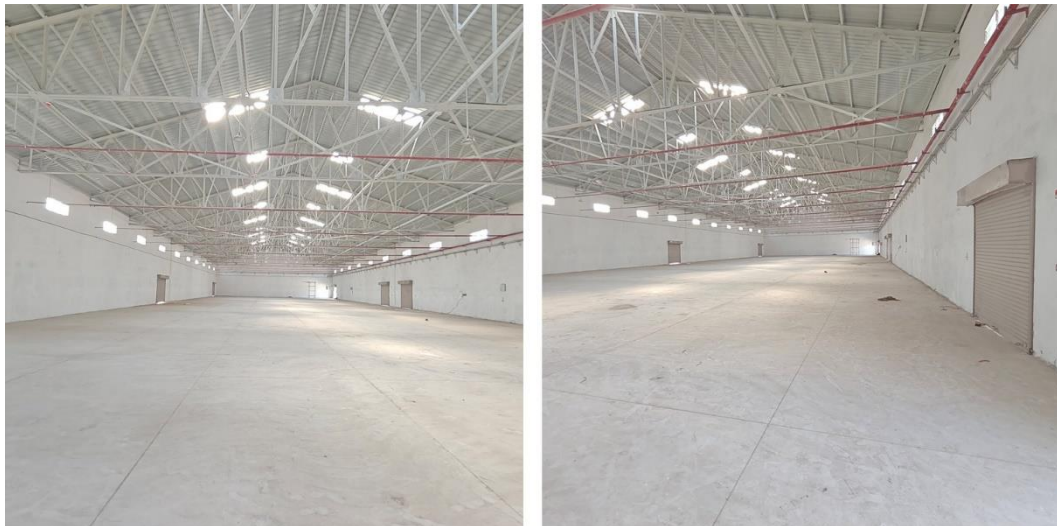
Inside View of Warehouse