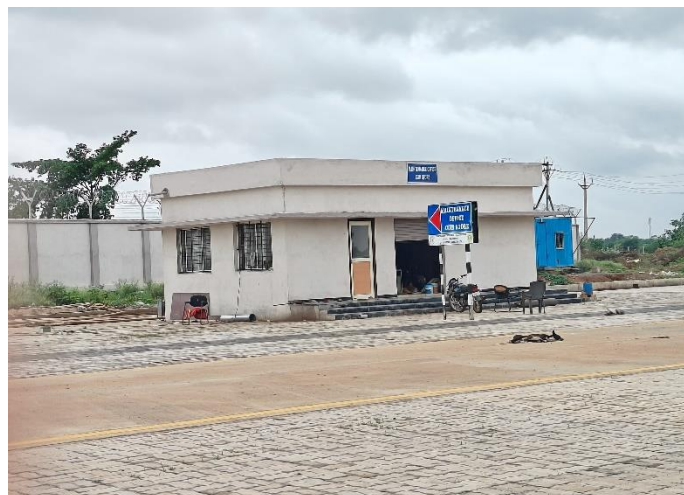
Maintenance Office cum Store